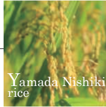
Yamada Nishiki rice

The king of sake rice Yamada Nishiki, that has been grown in Hyogo Prefecture.